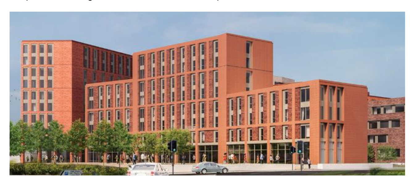
Views across the frontage of Block A towards Block B. Above is the refused development; and below is what is now proposed.

The following images help to illustrate how the applicant has sought to address the concerns identified by Members of the Planning Committee; they should be considered in context of the plans and images towards the end of this report.