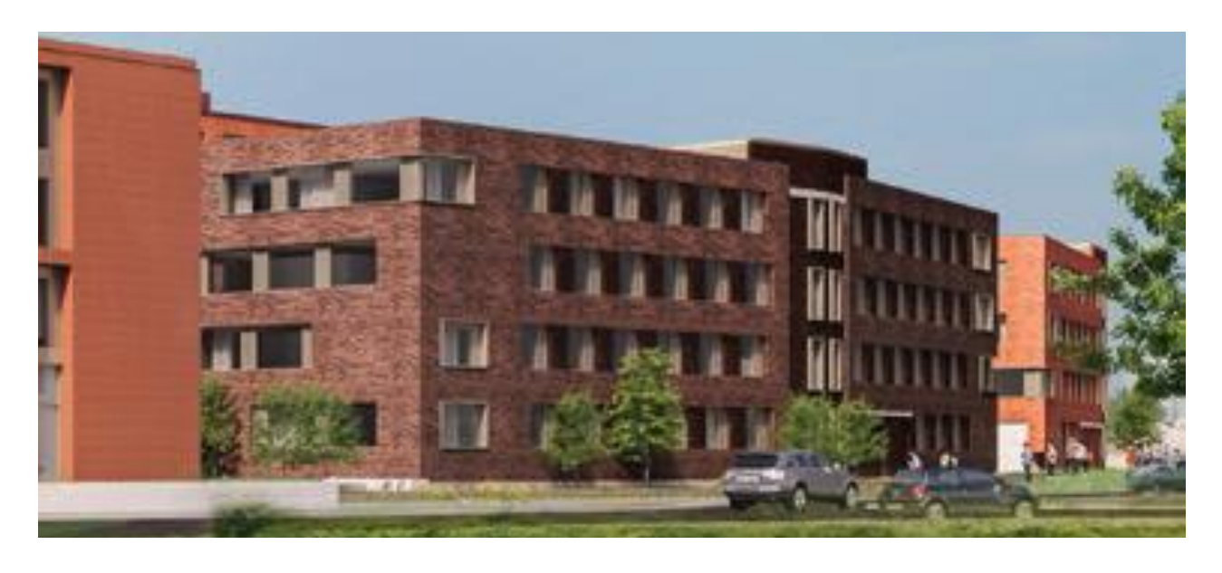
Views along the frontage of Blocks C and G. Above is the refused development; and below is what is now proposed.