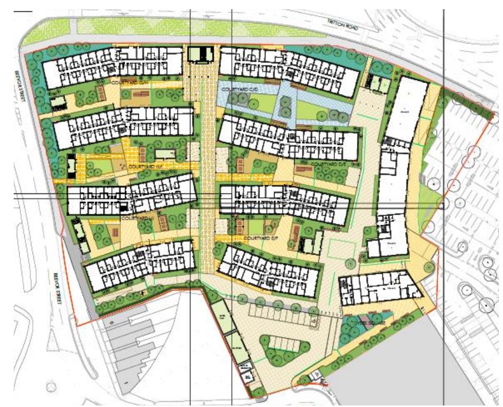
Overall Proposed Landscaping Scheme

Consequently, subject to the landscaping for each courtyard and external areas being implemented, the proposals would be in accordance with the Framework in respect of the environmental dimension of sustainability outlined in Paragraph 8.