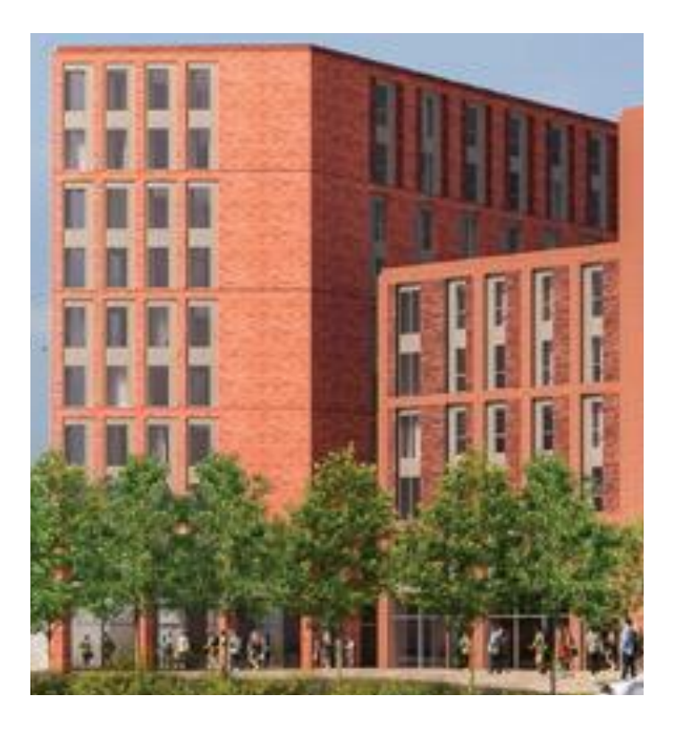
Views of the interface of Blocks A and Block B. Above is the refused development; and below is what is now proposed.