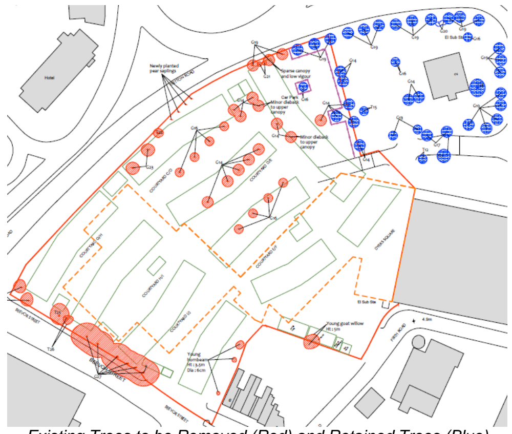
Existing Trees to be Removed (Red) and Retained Trees (Blue)

Whilst there would be total loss of trees and other vegetation during construction and with this a temporary loss in habitat, once the scheme of landscaped courtyards proposed have become established, there would be significant gains in habitat, particularly due to the variety and quantity of planting through tree and other lower level planting.