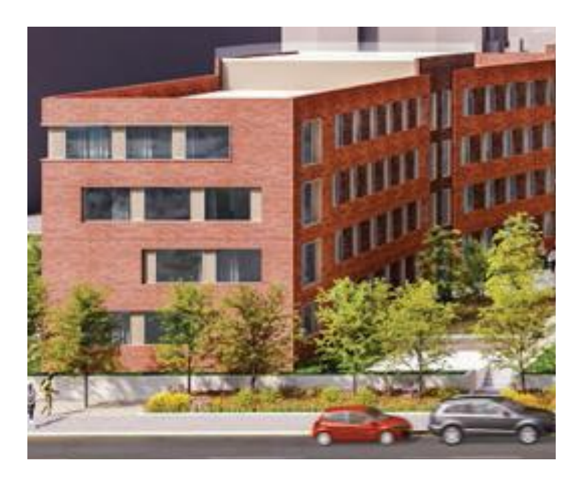
Views towards the southern elevation of Block G. Above is the refused development; and below is what is now proposed.